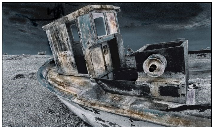
Dungeness by Rex Bamber F.R.P.S