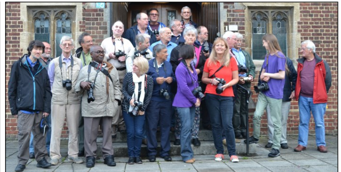
.....which everyone ignores